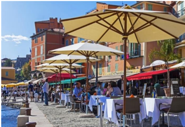
Cassis waterfront cafes

Add on a few days in Provence, Nice or Monaco either end to make it a truly memorable holiday.