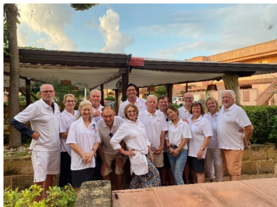
Allsail's crews Sicily 2023

Enjoy the culture, the people, the fine French food and wine - and of course the camaraderie of your Allsail crew mates – sailing on our luxury 48ft to 51 ft yachts