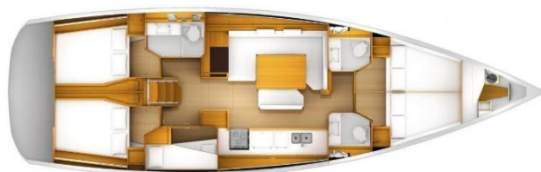
Jeanneau 519 layout

We board the yachts at Marseilles on the afternoon of Monday 16 th June 2025 - our welcoming dinner is at a top restaurant near the marina.