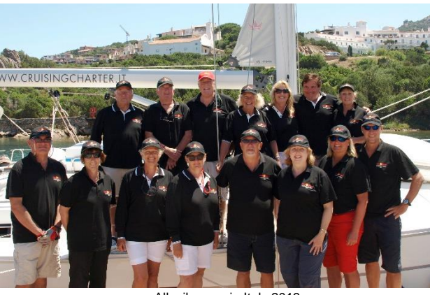
Allsail crews in Italy 2013

Enjoy the culture, the people, the food and wine, swimming in crystal clear water and of course the camaraderie of the Allsail crews - sailing in our flotilla of luxury 44 to 51ft yachts*.